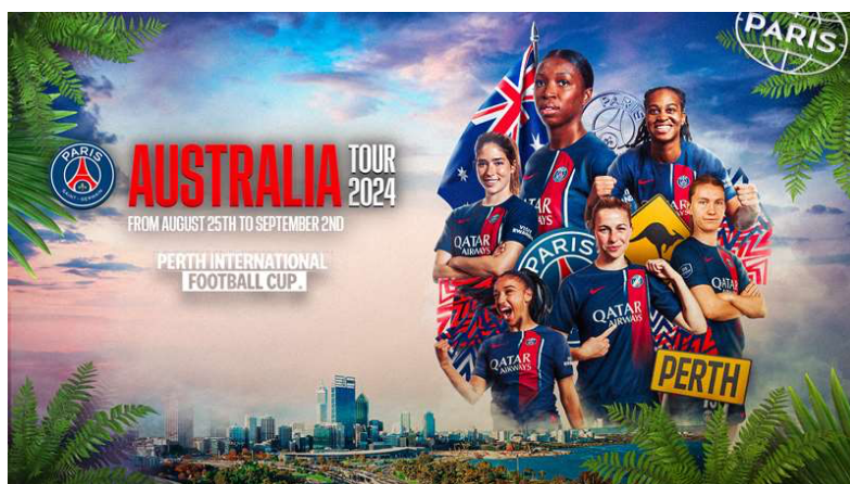
TRAILER OF AUSTRALIA TOUR